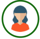
Women and Youth