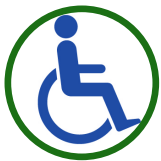
Working Persons with Disability