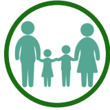
Parents or Guardians of Child Laborers