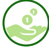
Low/Minimum Wage Earners and Seasonal Workers